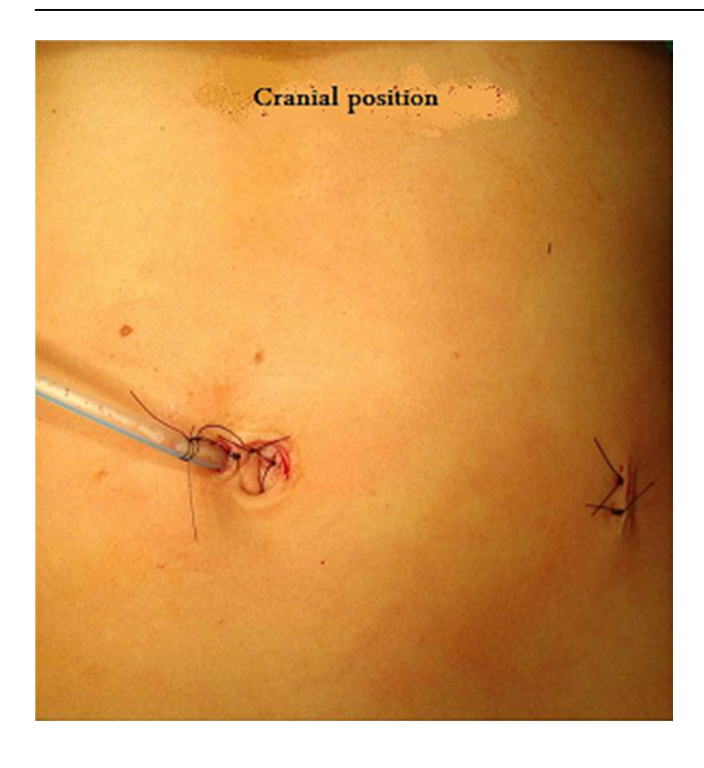
Fig. 2 - Postoperative appearance.

After visualization of Calot's triangle, a standard laparoscopic cholecystectomy procedure was performed using a standard laparoscopic set (Rudolf and Stryker Storzt). All the anatomical structures were closed with titanium clips, leaving two clips on the stumps of gallbladder vessels and the gallbladder duct. Gallbladder removal was performed by using an electrocoagulation hook from the neck to the fundus. Accurate hemostasis control was performed with traction provided by the gallbladder still attached to the liver before its final liberation, followed by rinsing of the operated area. As a standard procedure, a Redon 10 mm drain was introduced through the umbilical incision. The gallbladder was removed via the umbilicus in a protective latex sac, which was prepared by ligating a sterile surgical glove. Fascia was closed by a 2/0 Polysorb running suture. The skin closure was performed by a 4/0 single or interrupted suture (Fig. 3). If the procedure lasted